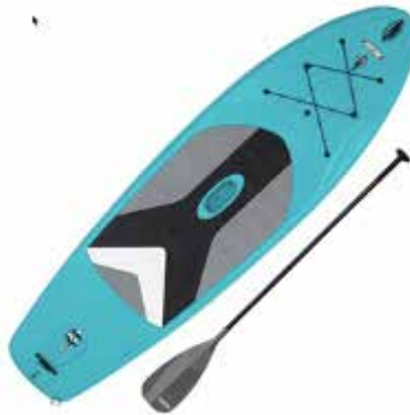
Stand Up Paddleboard

The Scholarship Committee was pleased with the number and quality of applicants and is looking forward to making the awards again next year. To fund next year's award, a raffle is being conducted. For a ticket price of only $10 you can enter to win your choice of a stand up paddle board, 11 ft fishing kayak, Marine Binoculars (all valued at $500) or $500 cash. Tickets will be available for purchase at the clean up on April 23, at the next HOBO meeting on April 25th, or by contacting Mac Adkins (334 300 6824 or mac@smarterservices.com ). The drawing will be done on Memorial Day – May 30, 2022.