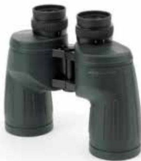
Marine Binoculars 10x50