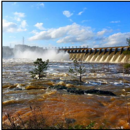
Lake Jordan Dam flooding after heavy rains

HOBOS and Friends 1st Quarter HOBOS meeting Monday, Jan. 25, 2016