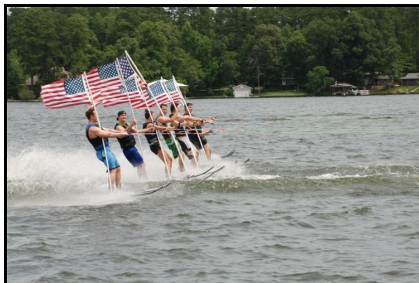
July 4th on Lake Jordan

HOBOS and Friends 4th Quarter HOBO meeting Monday, Oct. 26, 2015